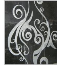
SHUSA DB 2500S