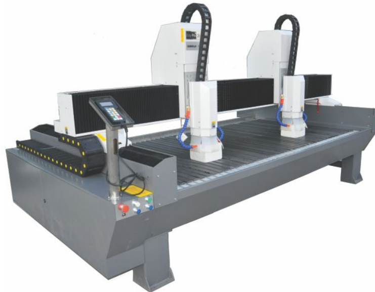
SHUSA DB 2500S-II